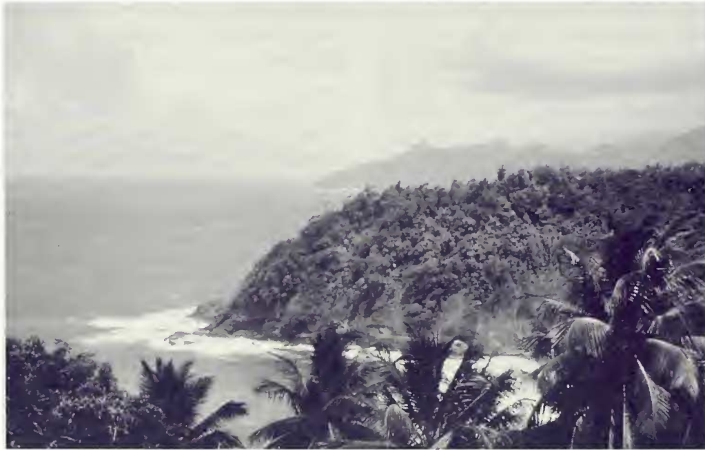
Figure 6.—East coast of Dominica near Castle Bruce, St. David Parish.

fort near Cabrit. At Castle Comfort Estate a sample of 36 individuals were taken from a colony of several thousand in a storeroom. The majority of the colony was located between a wall and a beam that was a few centimeters from the wall. The overflow of several hundred from the colony was clustered on the wall below the beam about 10 m above the floor. At Clarke Hall Estate, individuals were taken on several occasions from behind shutters and shingles of the main building and some were caught inside of the house. Eight Tadarida and Molossus also were taken from behind a shutter at Springfield. Nine free-tailed bats were taken from a colony in the attic of the Catholic Church in Portsmouth. Individuals of Tadarida brasiliensis were taken from between the boards and corrugated tin roofs of buildings at Sylvania and Morne de Moulrier. Sylvania, at more than 550 m in elevation, is the highest locality from which we have recorded this species; the population was estimated at several hundred bats. Brazilian free-tailed bats were netted over a pool in the Fond Figues River near Castle Bruce, over the water works tank in Antrim Valley, in the open areas and over the Layout at Clarke Hall Estate, and under large mango trees at Springfield. Free-tailed bats were shot as they flew over open areas at Clarke Hall Estate and a single female was shot near Marigot as it flew over the beach at dusk.